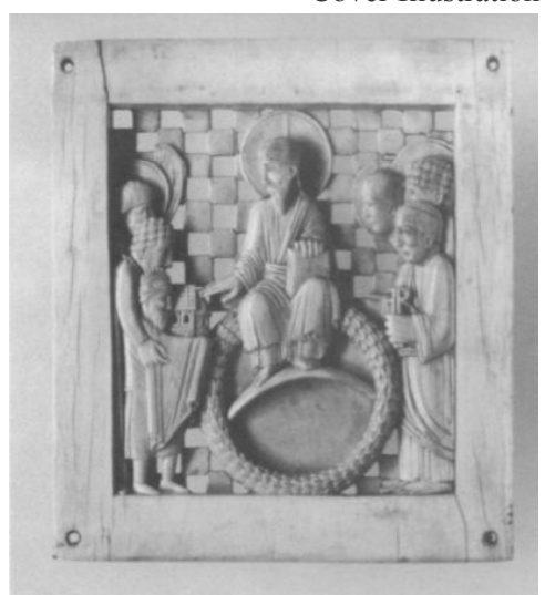
Cover Illustration Examples