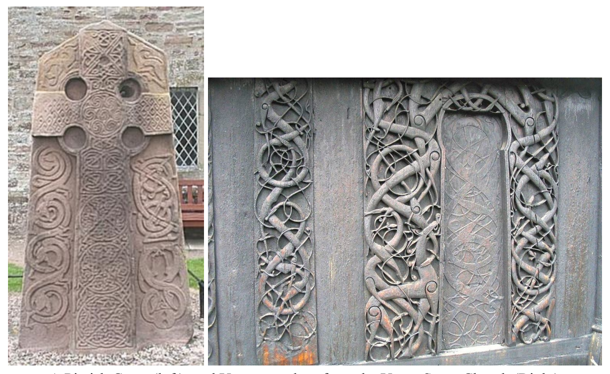
A Pictish Cross (left), and Urnes wood art from the Urnes Stave Church (Right)