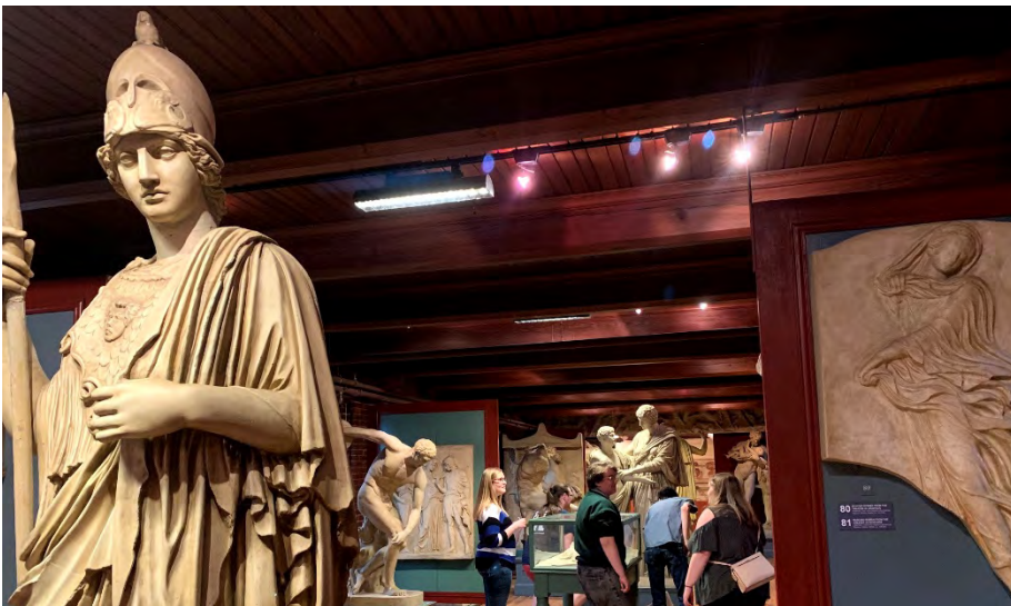
Left: Classics students tour Slater Memorial museum in Norwich, CT