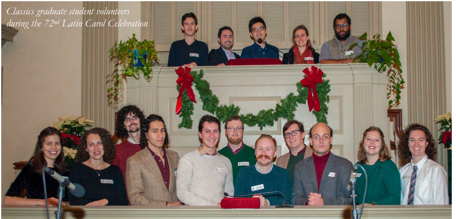
Classics graduate student volunteers during the 72 nd Latin Carol Celebration