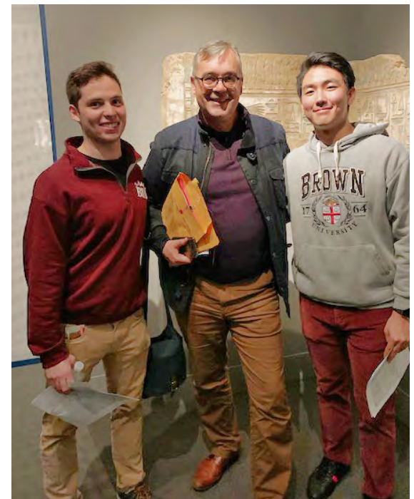
Right: Classics members enjoying the department trip to the MFA in Boston, MA